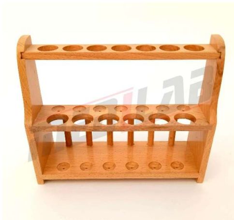
Three Layer Test Tube Stand