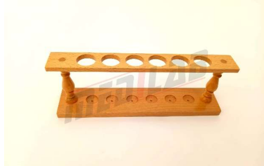
Test tube Rack