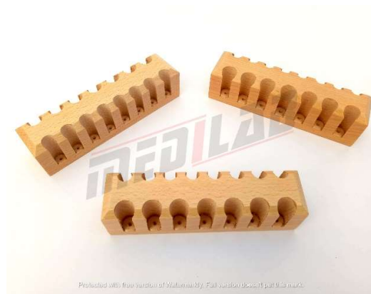
Test Tube Block