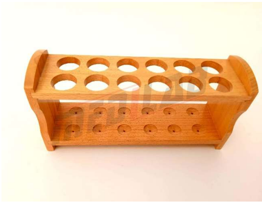
Test tube Rack