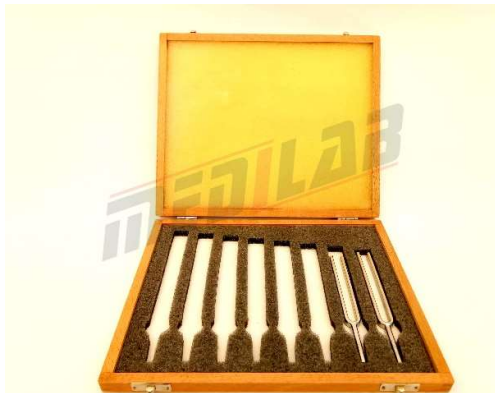
Tuning Fork Box