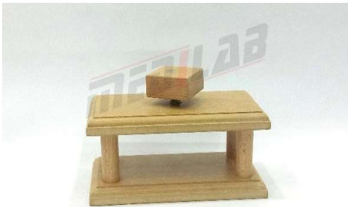
Nut & Bolt