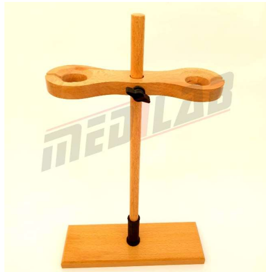
Double Funnel Stand