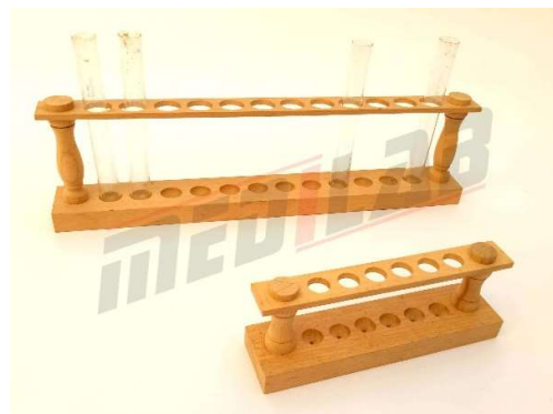
Test Tube Racks