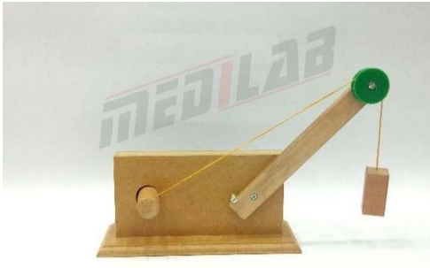
Wheel & Axle