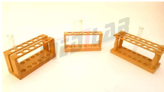
Test Tube Racks