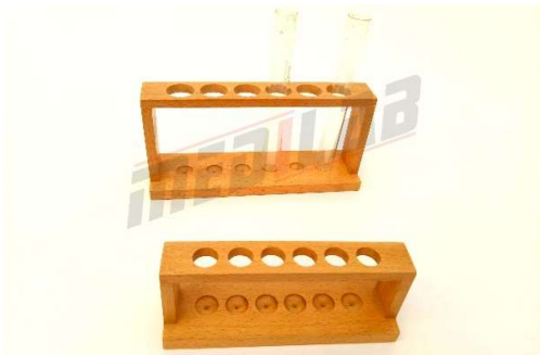
Test Tube Racks