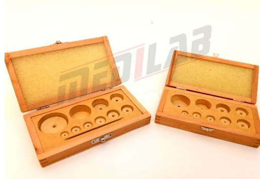
Density Cubes – Box