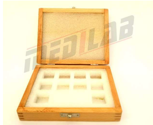
Density Cubes – Box