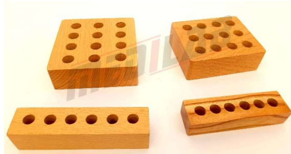
Density block for Metal Cylinders