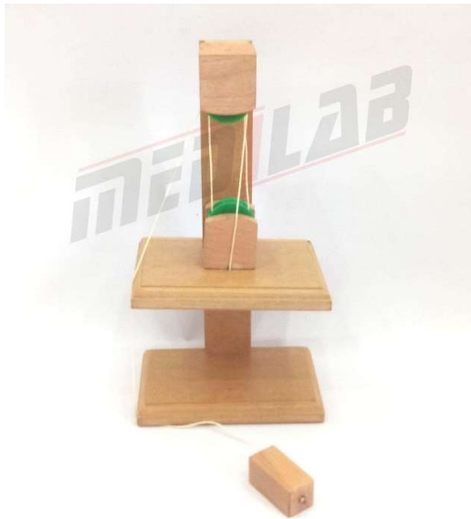
Block & Tackle Pulley System