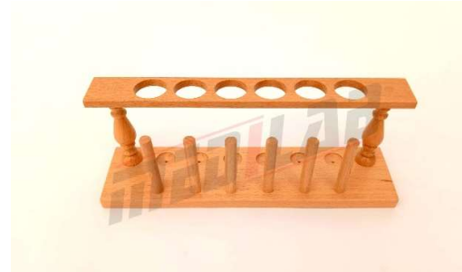
Test tube Stand